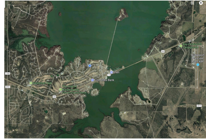
Satellite view of Runaway Bay, Texas on Lake Bridgeport